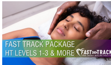
FAST TRACK PACKAGE HT LEVELS 1-3 & MORE