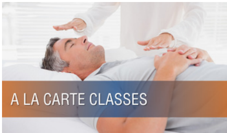
A LA CARTE CLASSES

An Investment in Your Personal and Professional Future.