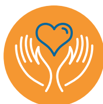
Step 2: EMPOWER