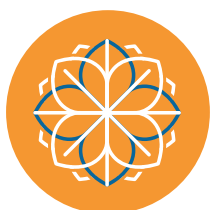
Step 1: ENLIGHTEN

Begin your Healing Touch Journey and join over 130,000 people like you that have changed their lives with these three easy steps: