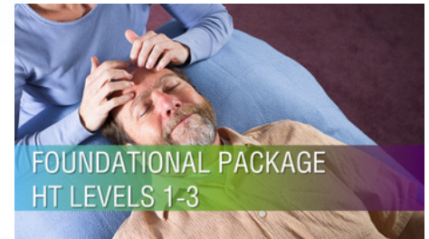
FOUNDATIONAL PACKAGE HT LEVELS 1-3