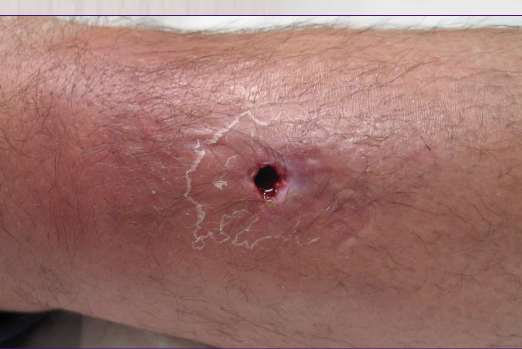
First Healing Touch Session 3/8/2010

1.3 cm x 1.7 cm x 1.4 cm with 5 cm tunneling