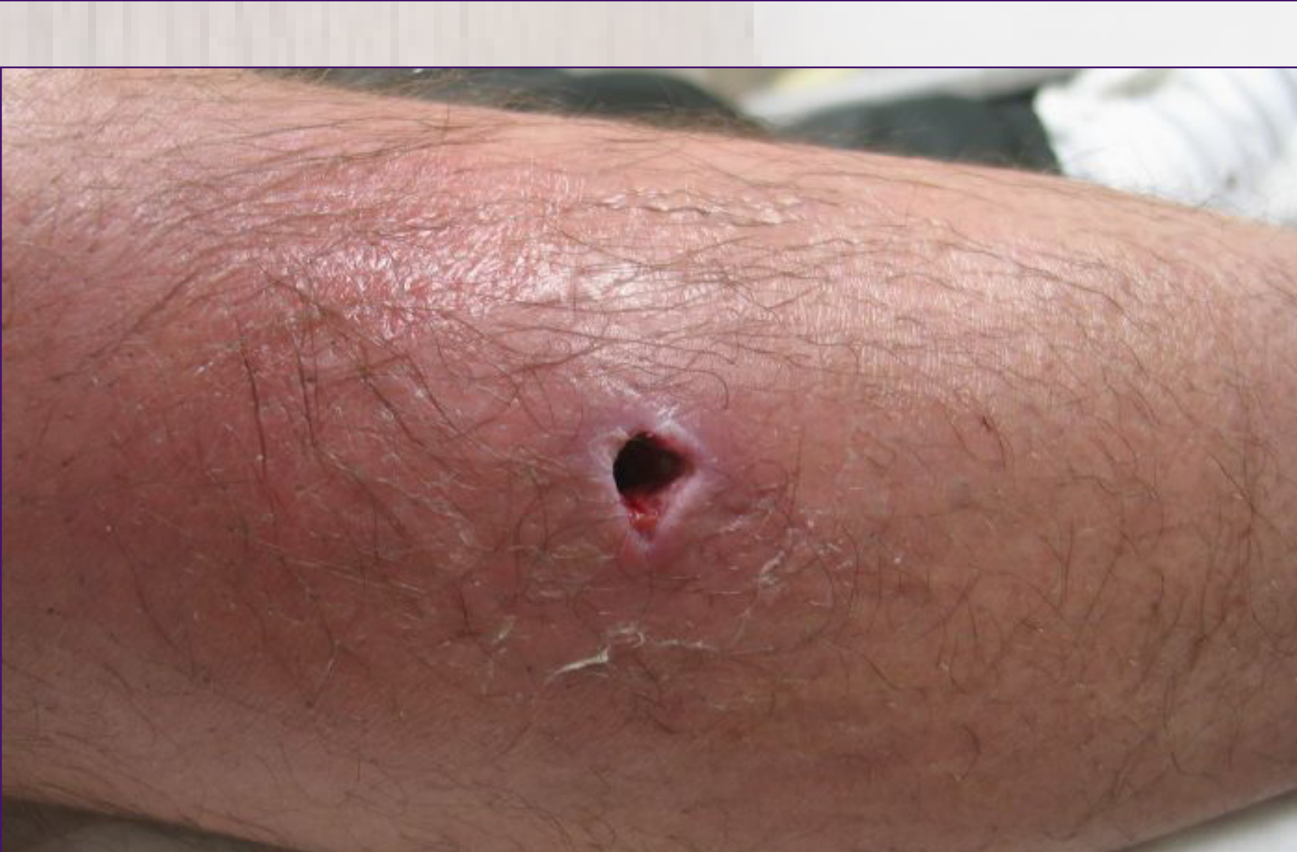
Fourth Healing Touch Session 3/11/2010

1 cm x 1.2 cm x 0.5 cm with 2.5 cm tunneling