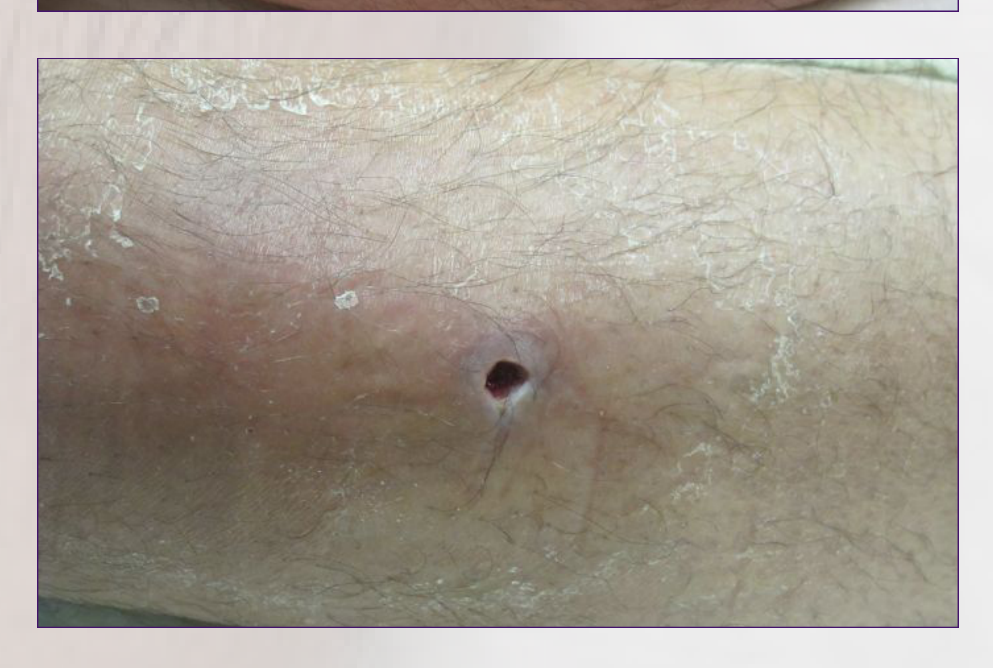
Wound Care Visit 3/17/2010

1 cm x 1.2 cm x 0.5 cm with no tunneling