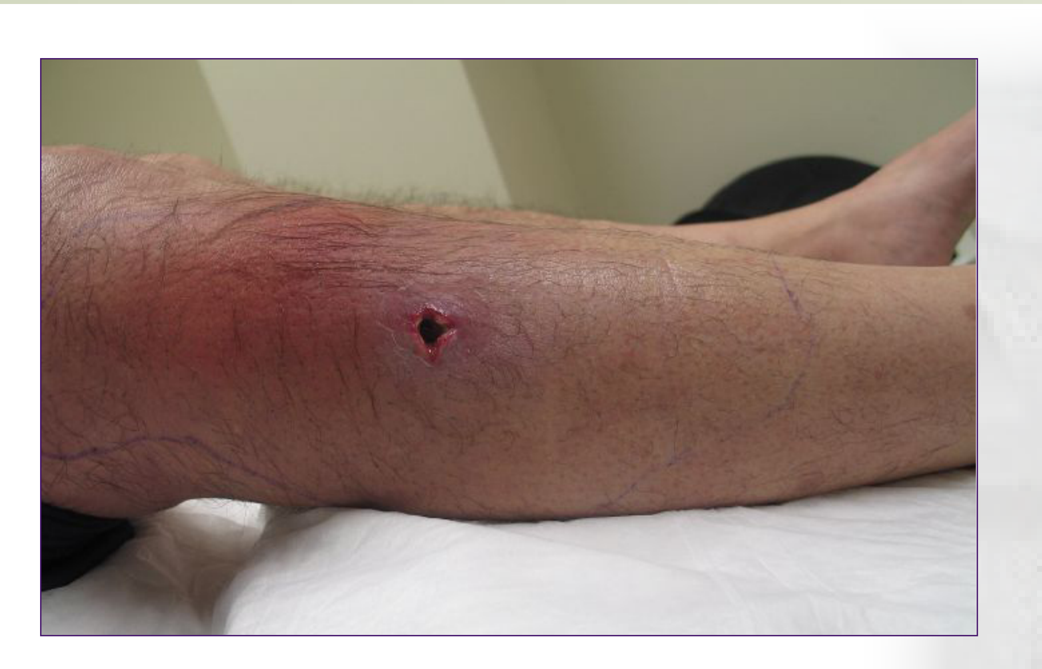
Initial Consult 3/4/2010

Our Wound Care team proposes that advanced wound care treatment complemented by Healing Touch assisted in closure of this patient's atypical wound. Hastened healing decreases overall cost and avoids complications such as infection, hospitalization and in extreme cases amputation.